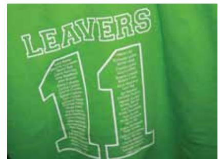
THE 2011 SKERN HOODIE