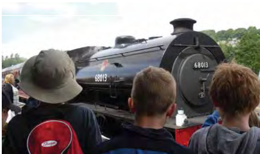
FROM THE TOP: YEAR 6 PAN FOR GOLD, ANA CABEDO AND HELENA HINES CRABBING AT SHERINGHAM AND TRAINSPOTTING IN THE PEAK DISTRICT