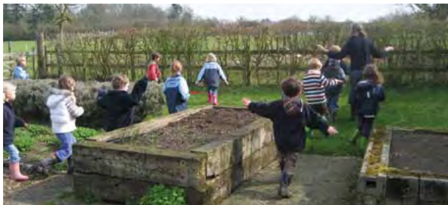
RECEPTION CLASS FLYING OFF TO FIND CATERPILLARS

The children extended their learning beyond the classroom on outings to local places of interest, such as the village church, Woodbridge library and Foxburrow Farm. This also gave opportunities for them to ask questions to develop their understanding of our