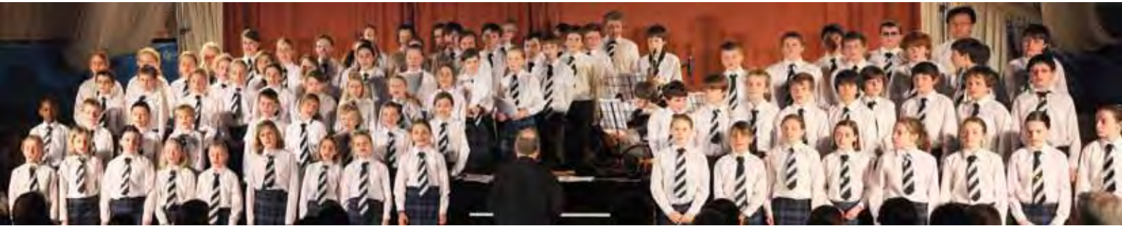
THE COMBINED VOCAL GROUPS, ACCOMPANIED BY 'THE WILD BUNCH', PERFORM AT THE SUMMER CONCERT