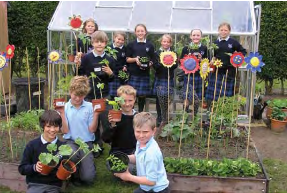
YEAR 5 PUPILS WITH THE FRUITS OF THEIR ENDEAVOURS IN THE SCHOOL'S GARDENING AREA