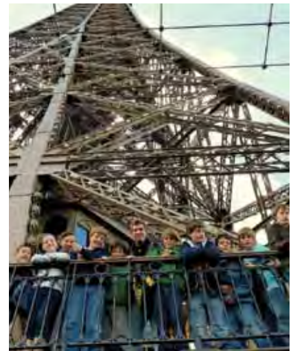
YEAR 7 AND 8 AT THE EIFFEL TOWER