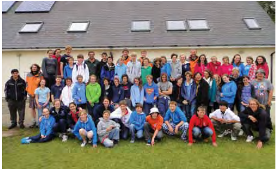
THE SKERN GROUP ABOUT TO DEPART