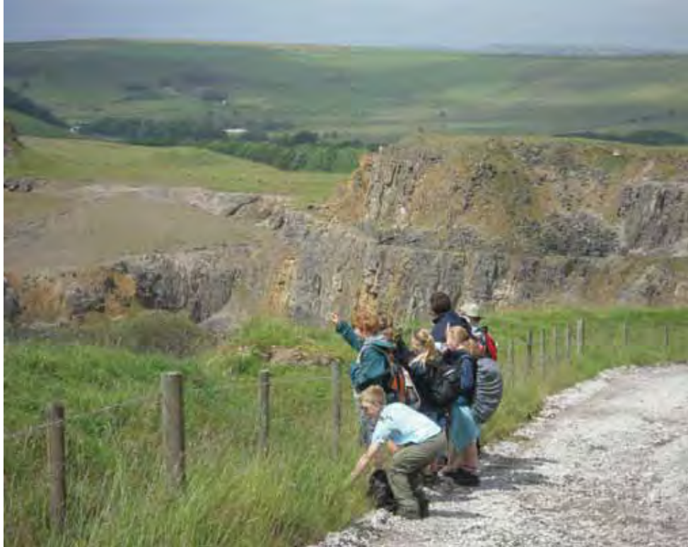
YEAR 6 ADMIRE THE STUNNING VIEWS IN DERBYSHIRE